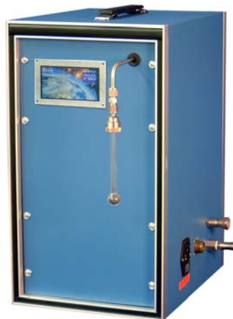
Figure 4. Gas adsorption equipment for fast evaluation of surface area

gas adsorption equipment takes a long time to measure surface area. However, PMI's QBET series of gas adsorption equipment is capable measuring surface area within a few minutes. The instrument is shown in Figure 4 was used to measure surface area quickly.