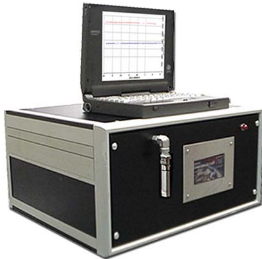
Figure 2 The PMI Envelope Surface Area Analyzer

The PMI Envelope Surface Area analyzer (Figure 2) was used in this investigation. This is a completely automated instrument capable of giving envelope surface area accurately, reproducibly and rapidly from measured flow rates and pressure drops. The average fiber diameter is computed from the envelope surface area using Equation 9.