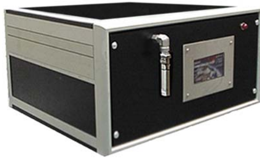
Figure 1 PMI Average fiber diameter analyzer

The PMI Average Fiber Diameter Analyzer (Figure 1) was used to measure average fiber diameters of a number of fibrous samples having porosity in the range of 0.74 to 0.79 (c: 0.26 – 0.21). This instrument yields highly reliable, accurate and reproducible data.