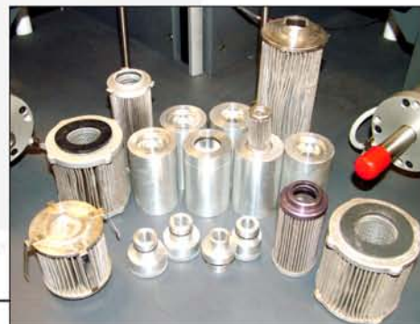
A variety of cartridges and adapters

The cartridge is clamped between movable heads in each chamber so that cartridges of variable length and diameter can be accommodated. The gas and liquid are fed into the center of the cartridge through the clamping head. The level of the liquid in the sample chamber is sufficient to completely cover the cartridge. A drain is provided for removal of the liquid from the sample chamber. The instrument has two sample chambers for bubble point and two for liquid permeability. Many attachments are available for testing of cartridges of various sizes.